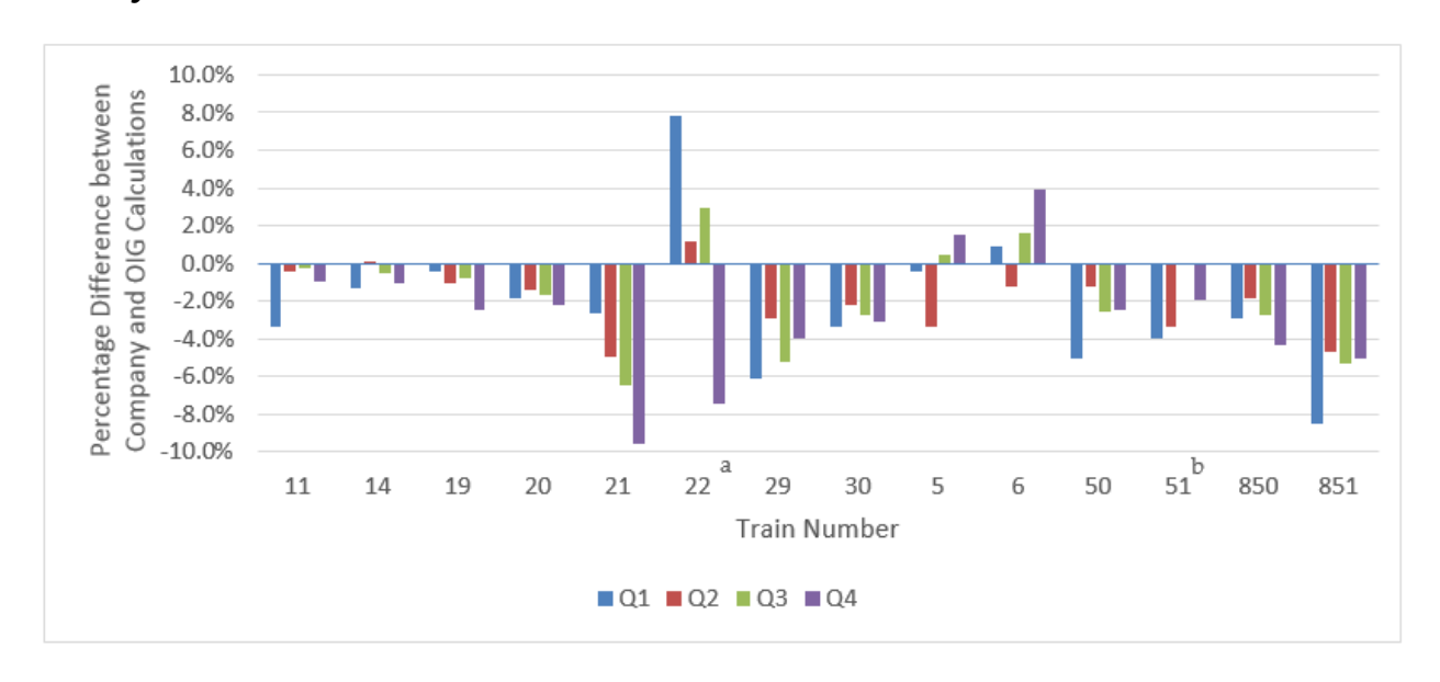
Figure 1: Company Quarterly Calculations of Total Delays for 14 Trains Were Mostly Understated in CY 2015